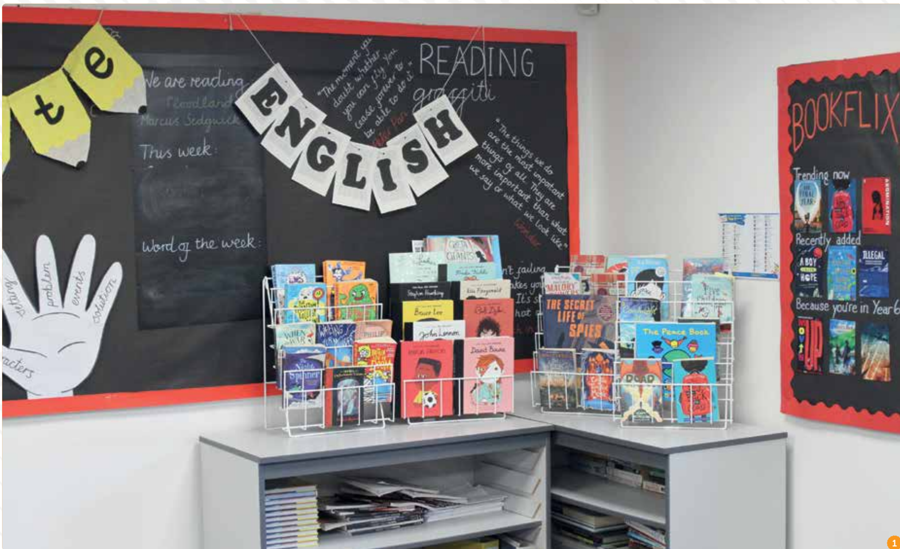
CAPTION 1-2 BGS' contribution to National Poetry Day