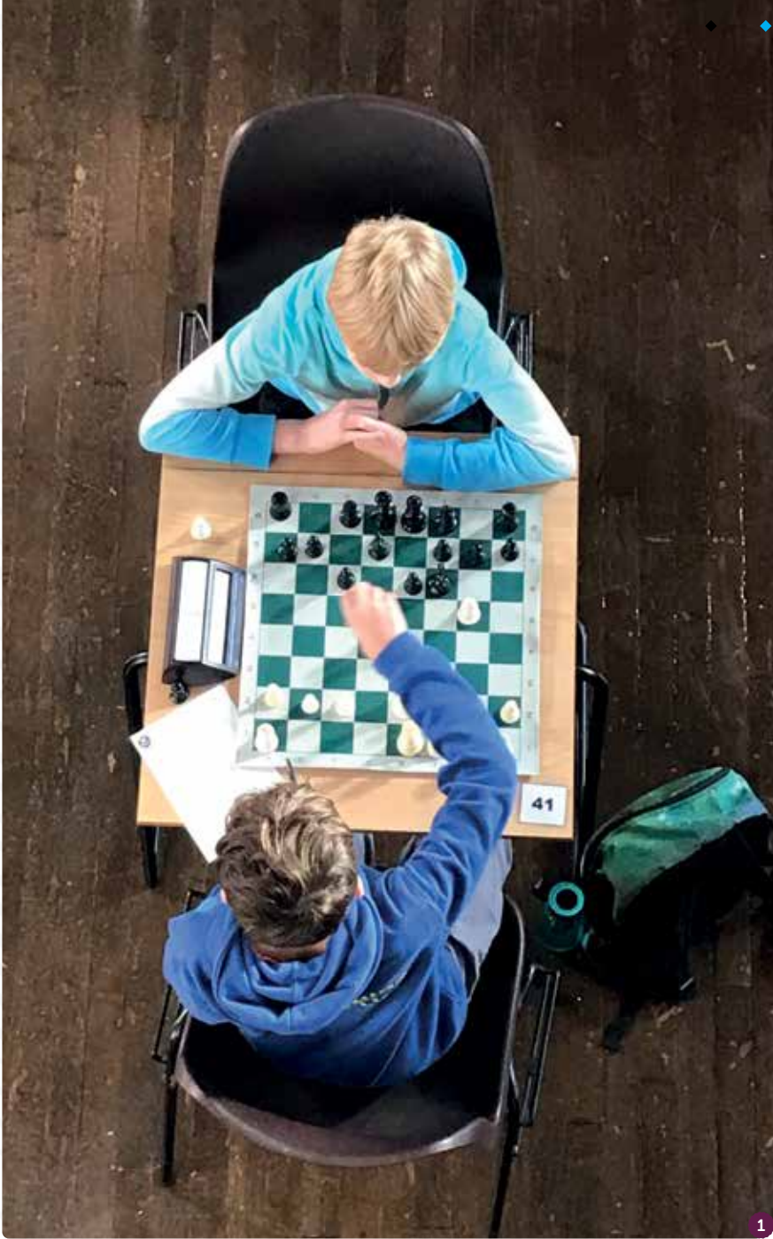
CAPTIONS 1 BGS was delighted to host the Yorkshire Junior Chess Association Grand Prix event on 11 November. 90 competitors aged 7-18 years old took part from chess clubs across the region. 2-3 Clock House pupils celebrated European Day of Languages with a fun quiz and language portrait.