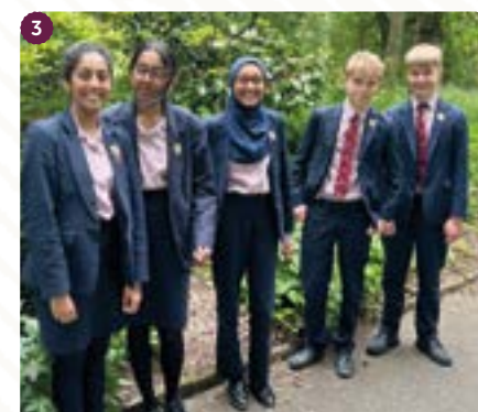
CAPTION 1 to 3 Wednesday 7 June was BeBOLD Day for Year 9, which took place in Lister Park