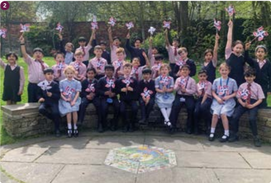
CAPTIONS 2 Clock House pupils had lots of fun celebrating King Charles III’s coronation.

“...” The atmosphere was simply amazing.