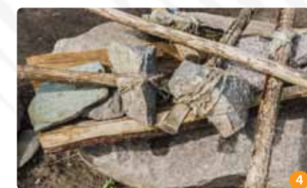
CAPTIONS 1 Life in the Stone Age 2 Pupils were very keen about what the day would involve! 3 The trip helped pupils with their studies 4 A highlight for many pupils was ending the day with a story around a traditional open fire