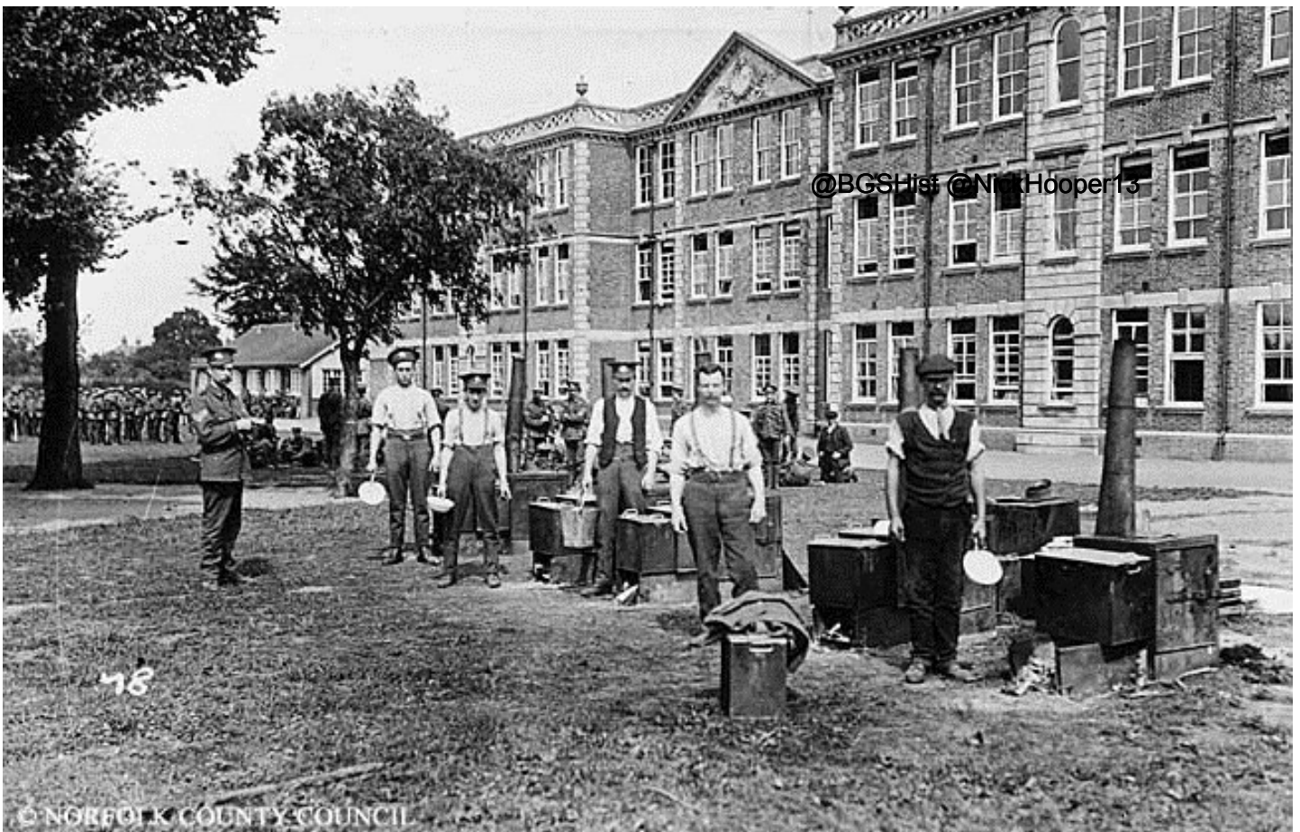
The City of Norwich School during World War 1, being used by the 1/4th Battalion of the Norfolk Regiment