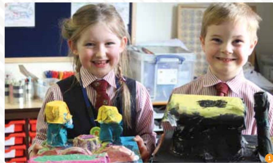
CAPTIONS 1 A club for children with vivid imaginations and creative ideas, who want their personalities to shine in their artwork 2 'I love chess; that's why I started this club. I love watching the children becoming involved and excited' ...