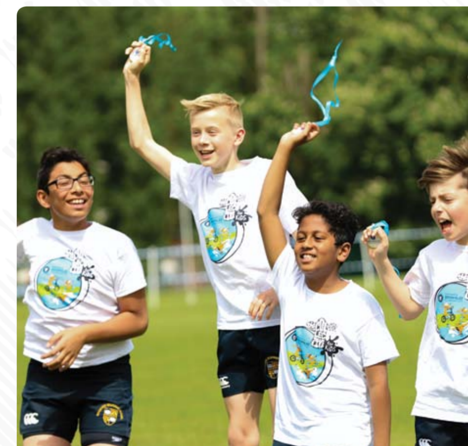
CAPTIONS 1 A perfect day for the first ever UK schools' Dragon Boat Race', River Aire 2 Pupils listened carefully ... 3 Pupils race against teams from other schools 4 Year 13 students mentor a group of Young Carers every week 5 Spring Fair 6 The whole BGS team made a sterling effort at this years Race for Life